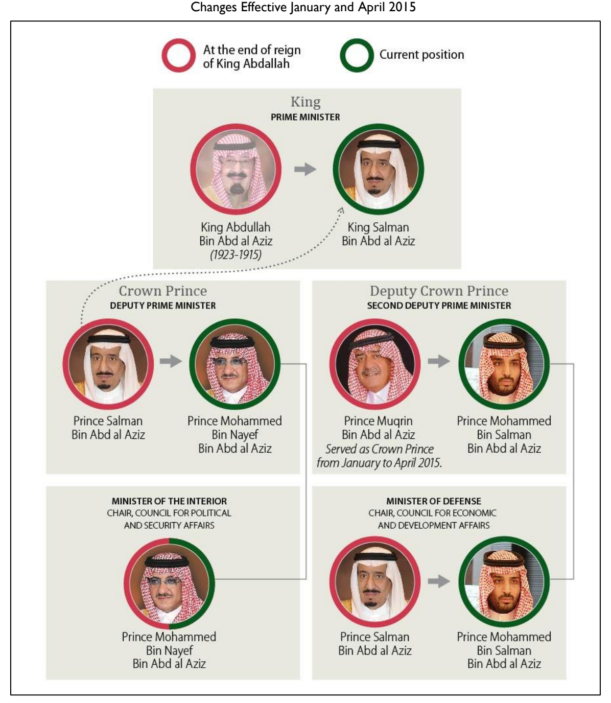
Figure 1. Saudi Leadership and Succession Changes

market share in a more competitive global oil market, but observers continue to speculate about what the policy's medium-term fiscal impact will be and whether it is sustainable. Saudi leaders describe emerging policy changes as part of a larger plan to transform the Saudi economy, boost non-oil earnings, privatize some state resources, and reduce unemployment. Debates over these economic initiatives provide context for consideration of the kingdom's political future and its security.